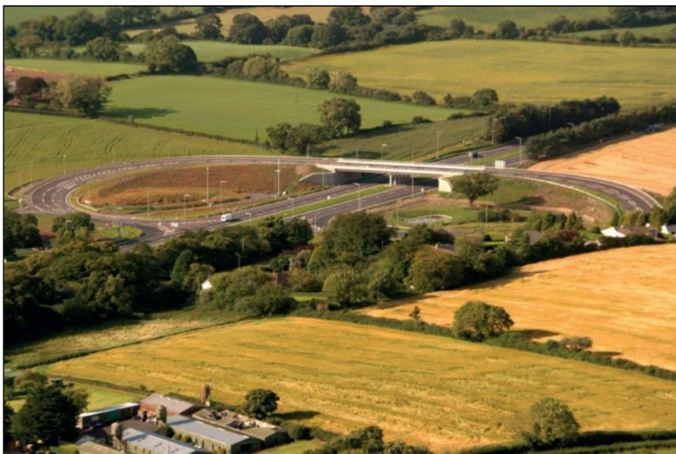
Existing Compact Grade Separated Junction at Pantridge Link, Hillsborough

In addition, the proposal includes the provision of a northbound on-slip at Castlewellan Road at Banbridge, a link between the existing underpass junction at Hillsborough Road, Dromore and Milebush Road and the closing of nine minor road junctions along this section of the A1.