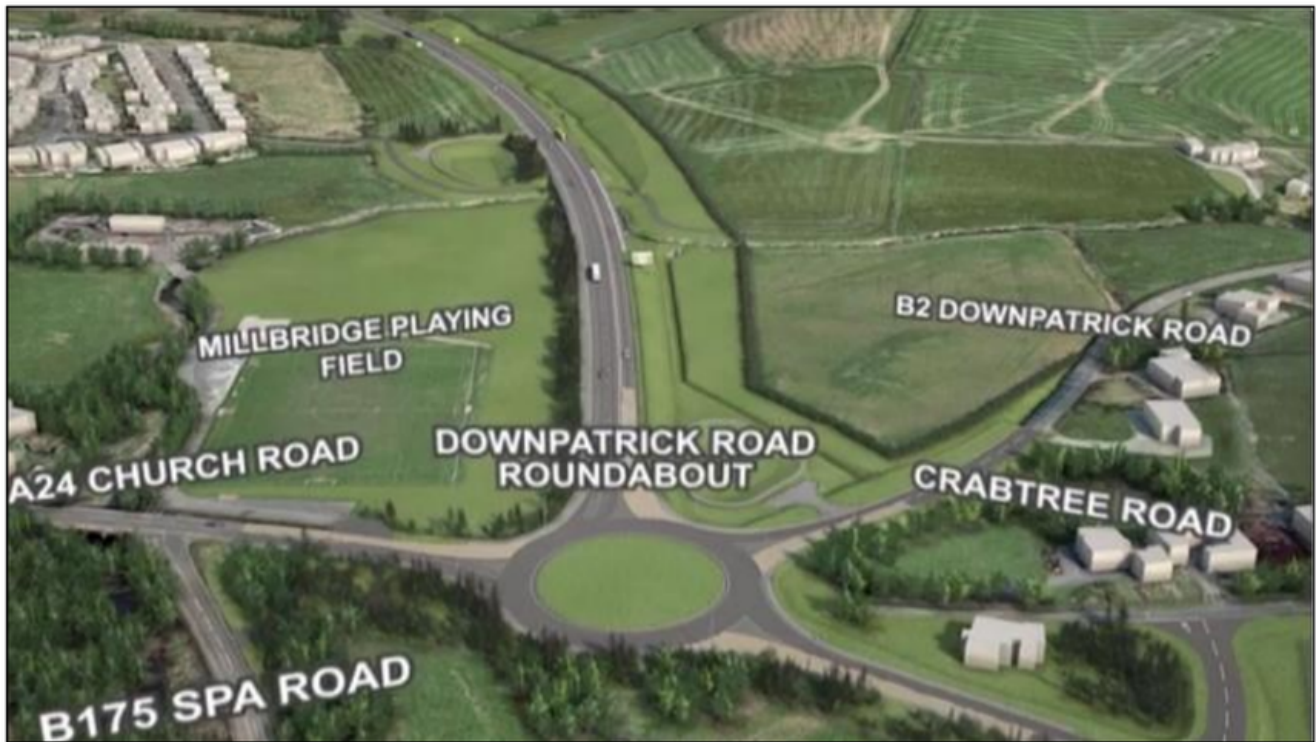
Image of Southern Junction at Drumaness Road