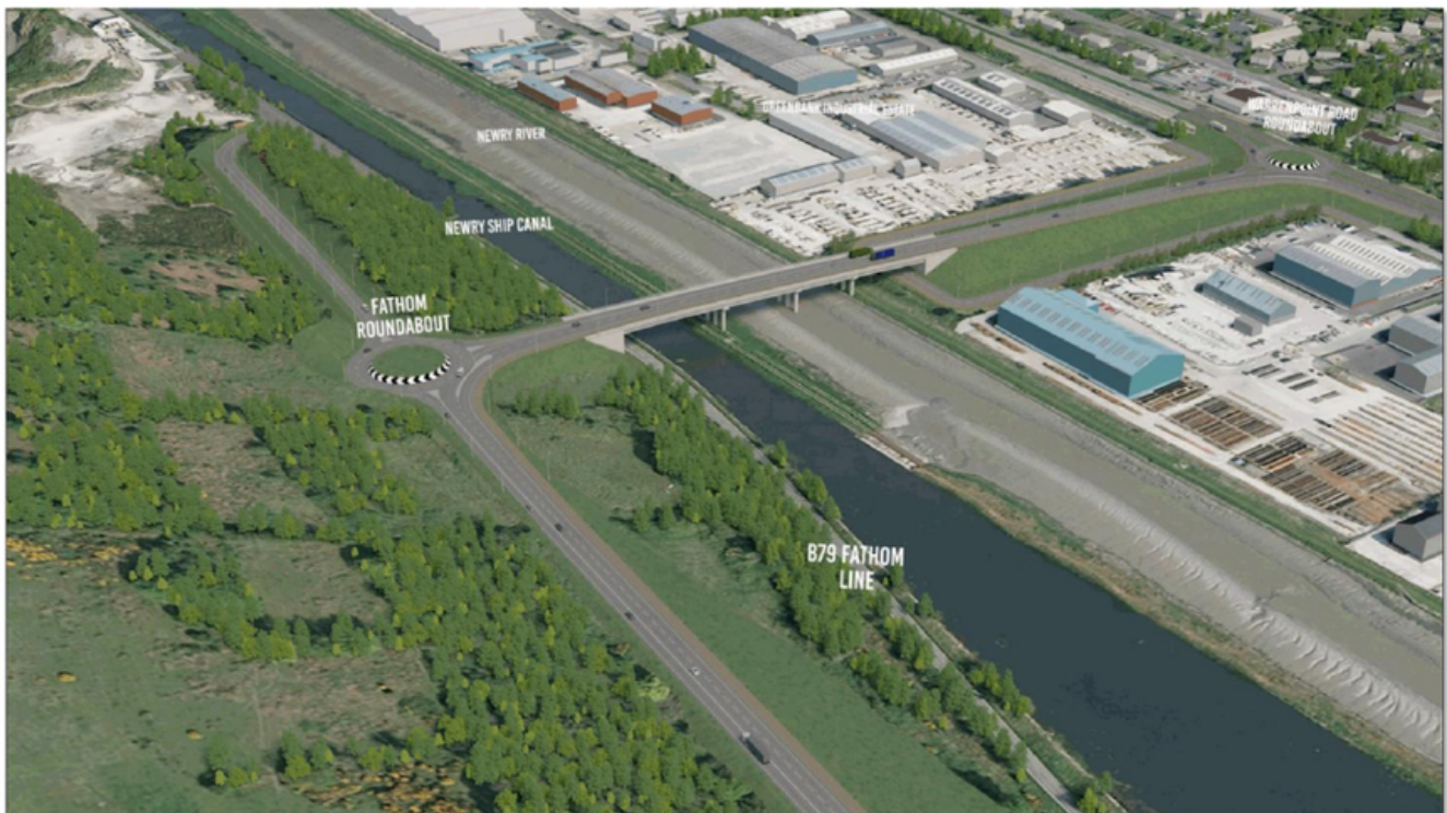
Image of the proposed Fathom Roundabout at B59 and Warrenpoint Roundabout at A2

https://www.infrastructure-ni.gov.uk/articles/newry-southern-relief-road-overview